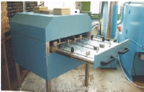
Primer-Drying System MW-IR 2.4